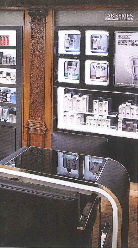
IMAGE: THE GENTLEMEN'S LOUNGE AT HARRODS. PRODUCT IMAGES: JERMYN STREET COLLECTION GROOMING BOX BY TAYLOR OF OLD BOND STREET, AVAILABLE AT SELFRIDGES (0800 123 4001). CLINIQUE SKIN SUPPLIES FOR MEN DARK SPOT CORRECTOR (01784 475 509). SHISEIDO MEN SKIN EMPOWERING CREAM, AVAILABLE AT HARRODS (020 7730 1234)

Transformer and Age Combat, men can rest-assured that every skincare concern is taken care of. Find the range at Harrods, House of Fraser Westfield, John Lewis Brent Cross, Liberty, Peter Jones and Selfridges.